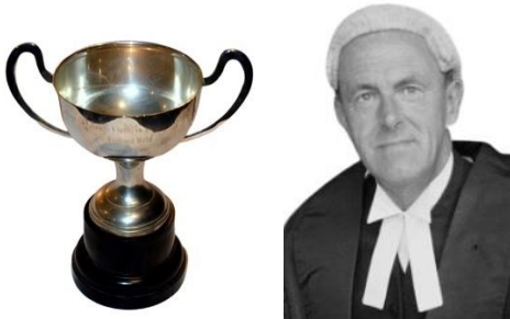
Sir Richard Wild Cup – Premier Reserve player of the year