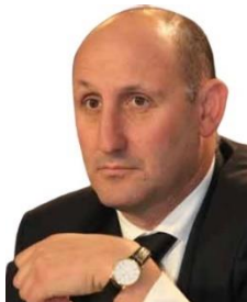
MJB (Jock) Hobbs Trophy Coach of the Year