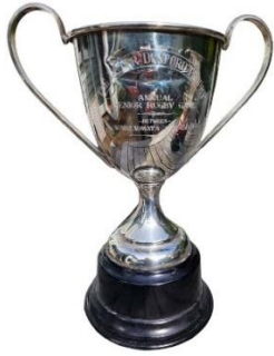
Dunford Cup vs Wainuiomata