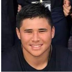
Samson Koneferenisi Sports Blue