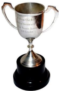
Most points scored – All Grades