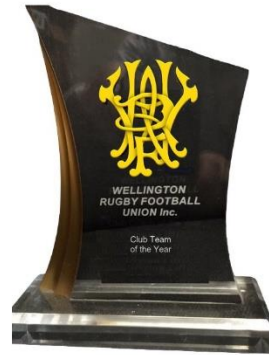
85kg Scallywags Club Team of the Year