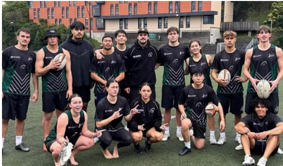
OBU/VUW Academy 2024