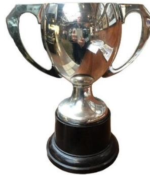
Wood Cup vs HOBM