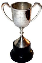
Most tries scored – Training Grades