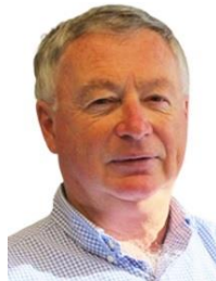
Braddock/Forde Cup – 85kg Player of the year