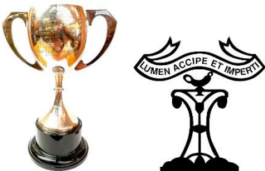
Supporters Cup – Most Improved Premier Team Player