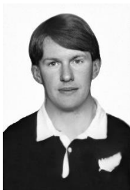
Stu Wilson Trophy- The Player who best epitomized the spirit of OBU Ru