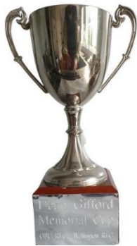
Gifford Cup vs Wellington