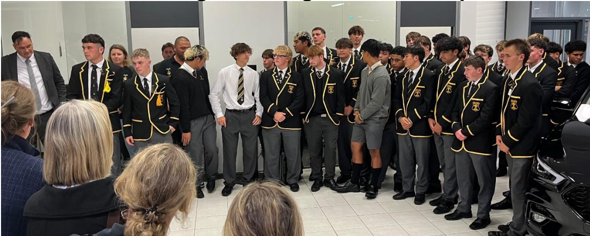
Wellington College 1 st & 2 nd XV announcement