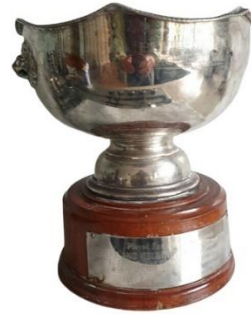
Algar Rosebowl vs Poneke