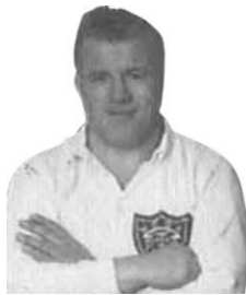
Frank Scott Memorial Trophy – The Social Player that best served the Club