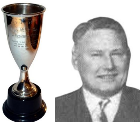
Ian Archibald Trophy – Premier Team Player of the Year