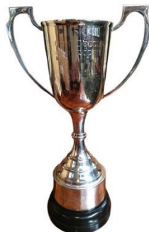
Ken Douglas Cup vs Northern United