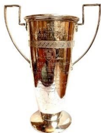
Noel Ryder Cup - Outstanding Player First Year out of School