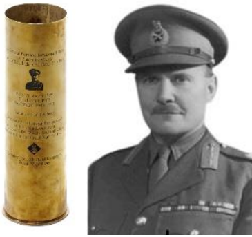
Lt Gen Bernard Freyberg Trophy - Volunteer of the Year