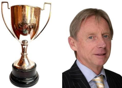
Brown Copeland Presidents Cup - Person who has best served the Club