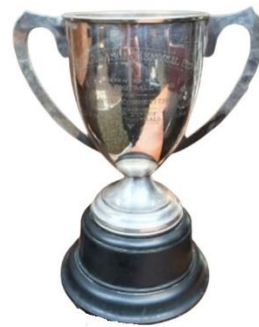
Lamason Cup vs Marist St Pats