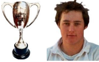
Nick Jones Memorial Cup - Player who has contributed most to Colts Green side (selected by the players)