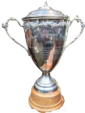
Verhoeven Trophy vs Petone