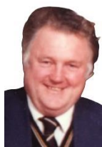
Dai Hayward Trophy - Top age grade points scorer