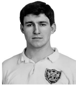
AI Keown Memorial Cup – Best Under 21 Player