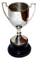
Prime Corporation Cup – Best Under 21 grade player: Colts Green