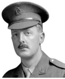
Dr Elliot Memorial Cup – Club Team of the Year